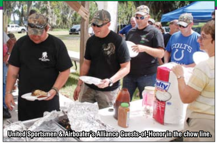
United Sportsmen & Airboater's Alliance Guests-of-Honor in the chow line.