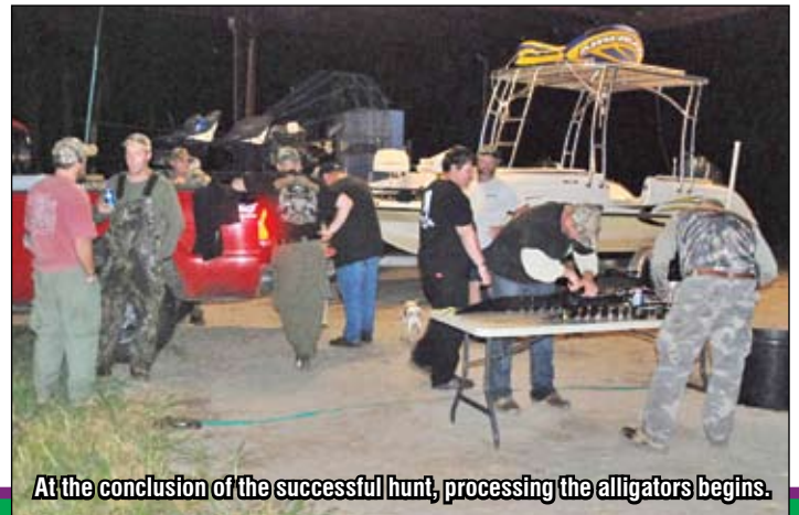
At the conclusion of the successful hunt, processing the alligators begins.