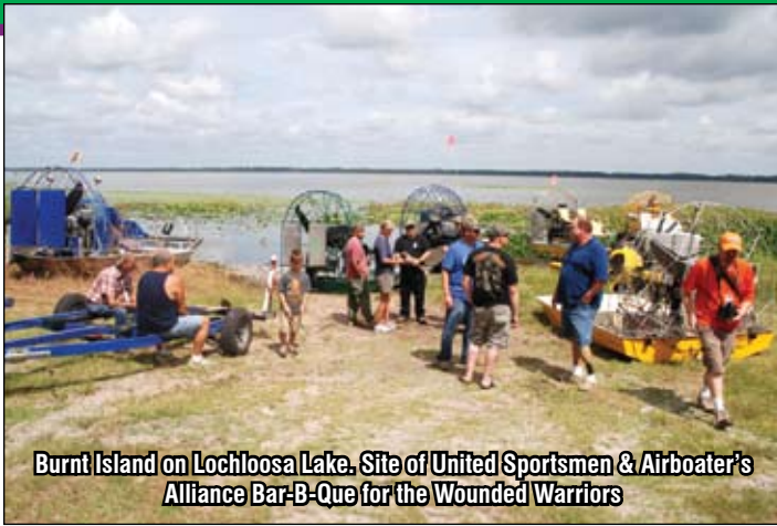
Burnt Island on Lochloosa Lake. Site of United Sportsmen & Airboater's Alliance Bar-B-Que for the Wounded Warriors